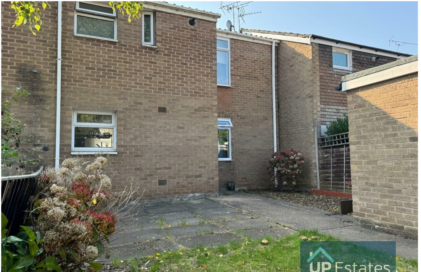
Agincourt Road, Coventry